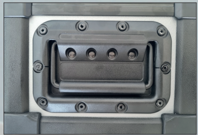
Strong ergonomic handles