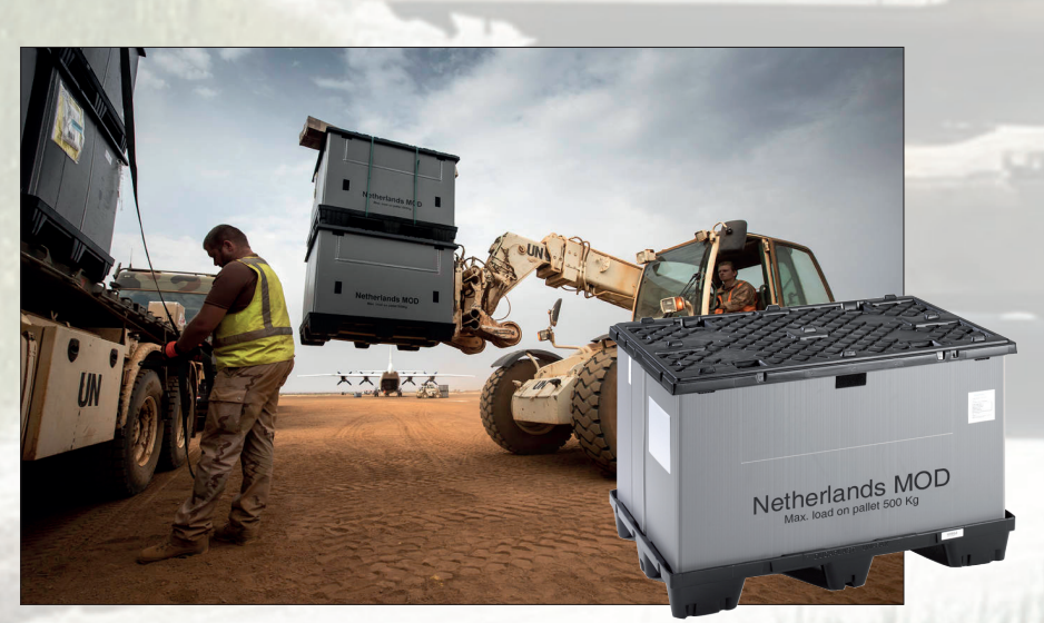
Lightpack assembled, 1200x1000x940 mm. (at series of minimum 100, we will supply the collar to your specification).