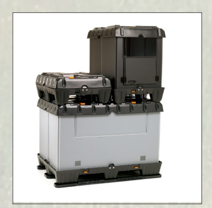
We supply Lightpack pro collars also "made to measure".