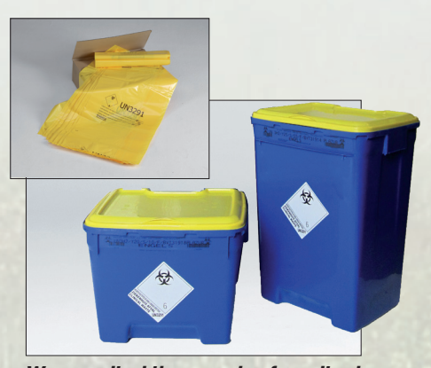
We supplied thousands of medical waste bags to the Nato in Kosovo.