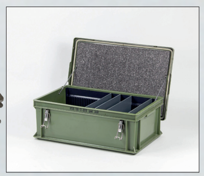
Interior with slide in dividers and lid with neoprene joint. Designed for administration in the field.

Our design departments (in the UK and NL) often develop client specific interiors in our boxes to answer our (military) clients needs. Below we present some examples: