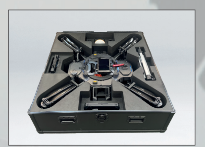
We produce foam inserts by milling or lasercutting also in small series.