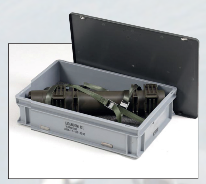
Straps and foam instead of shock absorbing filling material.