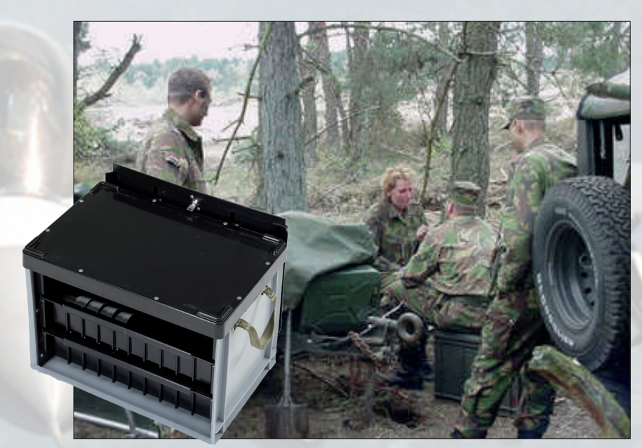
First aid kit for first line use.

Together with the Dutch Airforce (that cooperated in this project with the Royal Netherlands Army), we designed this first aid kit for our Air Assault Brigade.