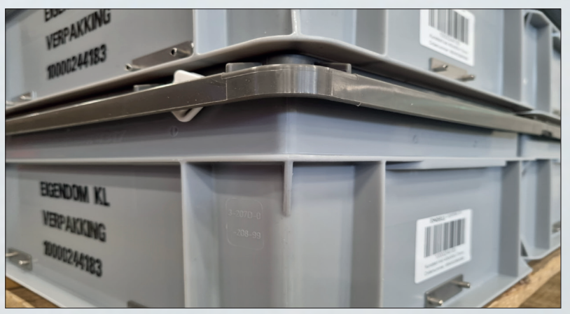
Military Normboxes have besides straps and foam, standard drip-proof lids (IP 51).

One of the most vital military operations is logistics. History has shown numerous instances where inadequate logistics compelled an army to retreat. Almost everything an army requires is transported to the frontline. In this context, robust packaging is essential. For non-corrosive goods or spare parts in plastic bags, our Normboxes™ are perfectly affordable solutions.