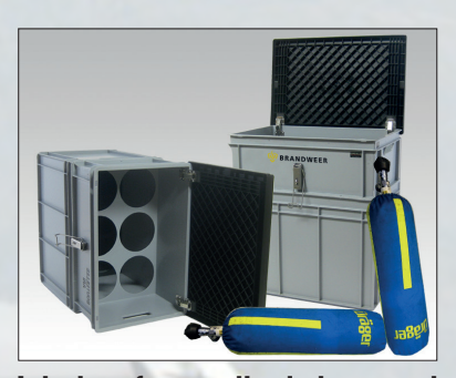
Interior for vertical transport and storage of bottles with pressurized air or oxygen. Many have been supplied to disaster relief units such as the French SSID's and Dutch Regional Firefighter units.