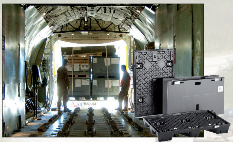
Lightpack Pallets and lids are shipped in stacks when empty, the folded collars fit together on a pallet with collar set up. Savings in empty return volume: 85%.

Often military transport goes by air, especially on foreign missions. Weight and stability of packaging play a mayor role in the process. Engels supplied the Netherlands MOD pallets, collars (3 different heights) and lids that have proven their durability since the mission in Afghanistan.