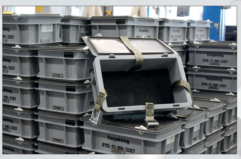
Strong, drop resistant (according to UN standard 4H2 level x) boxes, sizes in between 5 and 90 litres, mounted with straps for fixation of spare parts, electronics and such.