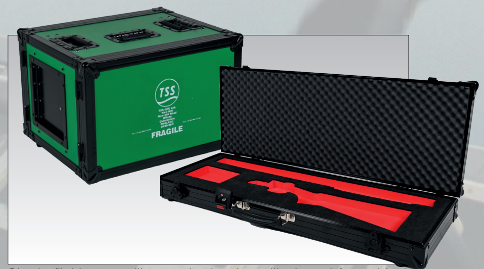
Classic flightcases, with an extra touch: multicoloured foam, black accessories.

ATA (Air Transport Association) specification 300 is often used as a standard for cases in the USA. There are various, DEF STAN and MILSPEC standards that apply to the transportation of goods for military application in Europe and the USA. Our design team is well aware of these, and our cases comply where necessary.