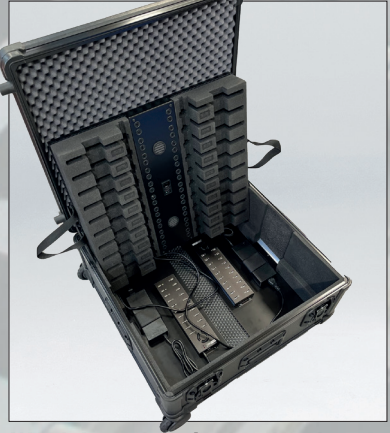
We integrate electronics in our cases, for charging and synchronizing phones and tablets.

Our Smartcases™ are in fact "flightcases light" They offer the same flexibility in design but with much sleeker profiles and are a lot easier to carry. Naturally, for bulkier products, when stacking is needed for storage or transport, we are happy to design/produce a flightcase. Besides options like coloured or printed panels made of rugged honeycomb plastic, we also supply black extrusions and grips as a standard option.