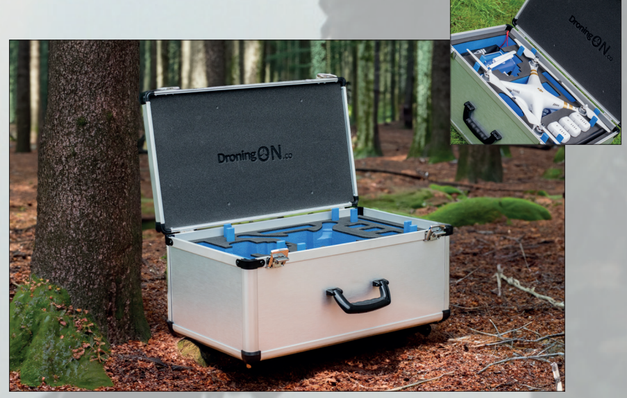
Smartcase™ containing a light drone.

Our Smartcases™ are in fact "flightcases light" They offer the same flexibility in design but with much sleeker profiles and are a lot easier to carry. Naturally, for bulkier products, when stacking is needed for storage or transport, we are happy to design/produce a flightcase. Besides options like coloured or printed panels made of rugged honeycomb plastic, we also supply black extrusions and grips as a standard option.