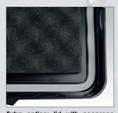
Extra option: lid with neoprene joint, splash proof (IP 53).