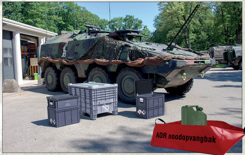
In the field we use fuel for heating and we store fuel for vehicles. We have to be careful with our environment. So, spill prevention is a topic. We designed an extra high case (made out of 2 standard cases) with rainproof lid, that takes 3 jerrycans and an absorption set. Besides this we supplied also a light, lidded palletbox taking 12 cans. And, for emergency use, we also provided foldable spill retention totes.