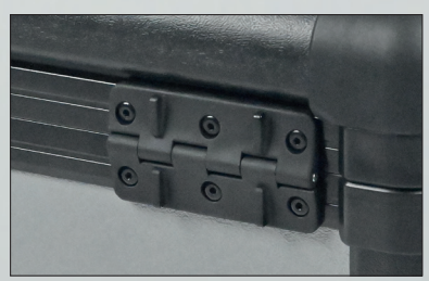
Strong, moulded hinges.