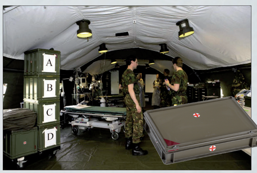
Normboxes in a field hospital. Not only for bandages, but also for bottles of nitrous oxide.

Field hospitals and medical support also require a significant amount of packaging. During peacetime, we build up our stock. When needed, bandages, medicine, and anaesthetics must arrive at the scene in large quantities, in good condition and easily accessible. Once again, Engels Group boasts a wealth of experience. This page showcases a selection of projects from our portfolio.