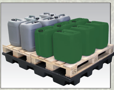
Spill containment platforms and containers are also part of our environmental program.