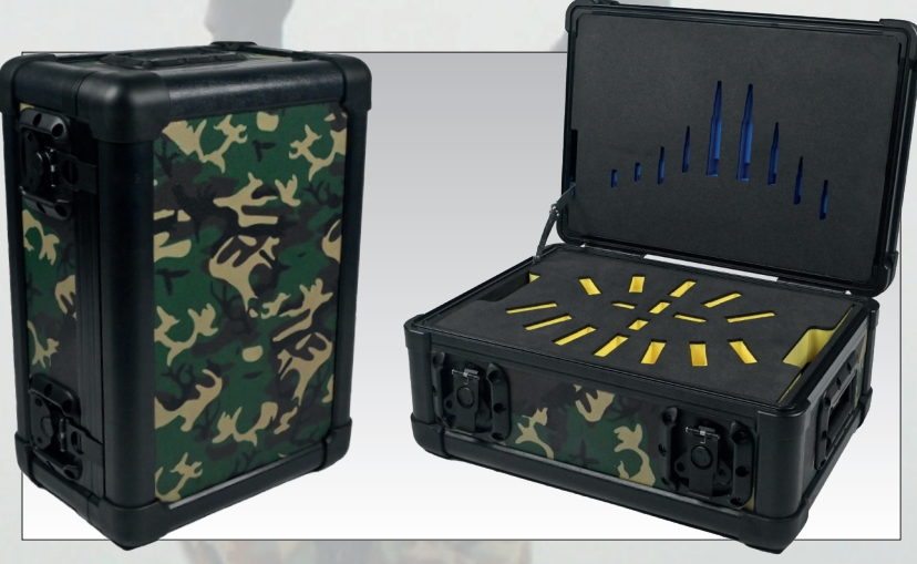
Exocase<sup>™</sup>, available in any camouflage pattern, the absolute top in fabricated cases.

Our EXOcase™ is a further development of the well-known flightcase. It combines the convenience of a fabricated case with the durability of a moulded transit case. The EXOcases™ unique "exoskeletal" design ensures maximum protection of its content during storage and transportation. Unlike flightcases, the outer poly urethane corners and ABS profile protection make our EXOcase™ extremely shockproof and thus fall resistant. Testing for UN approval classification "X" poses no problem for the EXOcase™.