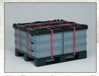
We offer several versions multiuse covers and pallets to ship our normboxes ^{\text{TM}} .

Often military transport goes by air, especially on foreign missions. Weight and stability of packaging play a mayor role in the process. Engels supplied the Netherlands MOD pallets, collars (3 different heights) and lids that have proven their durability since the mission in Afghanistan.