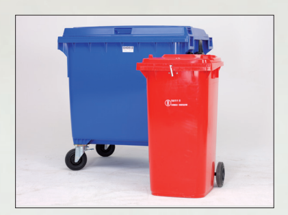
We store wheelybins in all sizes and colours, also UN approved for cleaning cloths or medical waste.

Our slogan is "Serving logistics and the environment". Besides pallets, palletboxes and cases, we produce products for waste separating, waste collecting and spill prevention. Many of these are used in barracks.