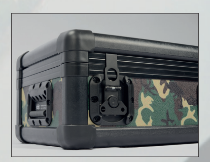
We can print any camouflage design and/or instruction on any type of case we fabricate.

We design and fix foam interiors in standard SKB, Nanuk or Pelicases, aiming to find the best fit for your needs. And when a standard size isn't suitable or proves to be too expensive, we can produce a custom smartcase or flightcase tailored to your item or toolset.