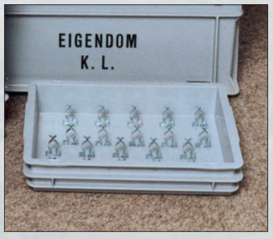
Clips will take a spare set of (Multifuel solution).