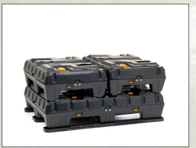
Lightpack pro modular, size 1200x800 mm and 800x600 mm.

We supply two versions of foldable containers. When used in bulk, we advise our classic Lightpack, where, when empty, pallets and lids are shipped in separate stacks. As RTP (reusable transport packaging) shipped empty as complete sets, we offer our Lightpack pro. Here, when empty, pallet, sleeve and cover form one unit.